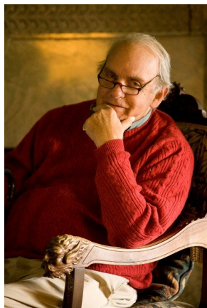
Frederick Buechner 1926-2022

For better or worse, it is a truth that, for twenty centuries, there have been untold numbers of men and women who, in untold numbers of ways, have been so grasped by the child who was born, so caught up in the message he taught and the life he lived, that they have found themselves profoundly changed by their relationship with him. And they have gone on proclaiming, as the writers of the Gospels proclaimed before them, that through the birth of Jesus a life-giving power was released into the world which to their minds could have been no less than the power of God himself. This is the central truth that Matthew and Luke are trying to convey in their accounts of the Nativity. And it was a truth which no language or legend seemed too extravagant to convey. What the birth meant—meant to them, to the world—was the truth that mattered to them most and, when all is said and done, perhaps the only truth that matters to anyone.”