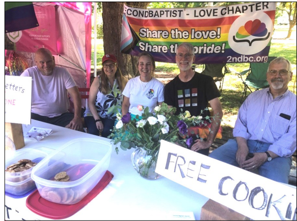
Second Baptist's Pride booth in 2022