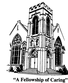
"A Fellowship of Caring"