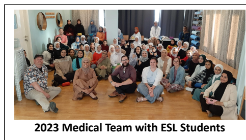
2023 Medical Team with ESL Students

LAC has sent four serving teams to Riverside: an initial Vision Team in 2022 to serve and confirm the partnership, a medical training team in 2023, and an ESL teacher and a Construction Team in 2024. For the medical trip, LAC donated, gathered, and sorted medical