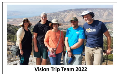
Vision Trip Team 2022

Toward having a gospel presence in a rapidly changing world, LAC began an official, global partnership with Riverside in 2022. 1 LAC embraced this strategic model and achieved this goal identified by church leadership, i.e. establishing a global partnership that met the criteria above. Beyond serving on site there, LAC is learning effective strategies for having a gospel presence with others in our local