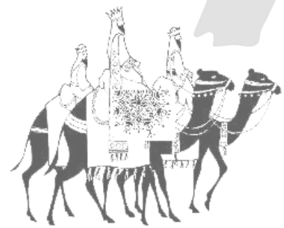
"...and they bowed down and worshiped him." Matthew 2:11