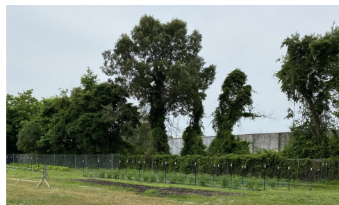
The Vegetable Garden