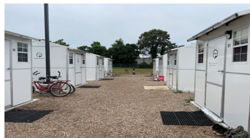
The Pallet Village

The surrounding area around the pallets are clean and well kept. They are currently using a tent for their meals, but in the near future they will be expanding with a building. They also have a very well-kept garden for fresh vegetables. They had four bathrooms equipped with showers and one was handicapped accessible. The mission team came away from this visit with the hope of somehow supporting this very worthy endeavor.