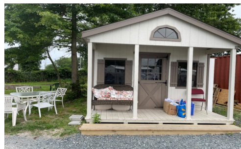
The Village Store