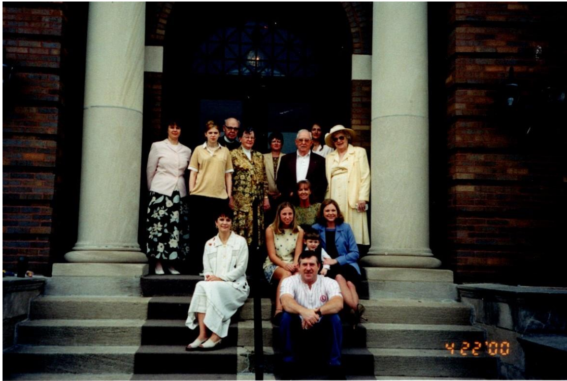
A photo of the front steps of the church our first year worshipping at our current location.