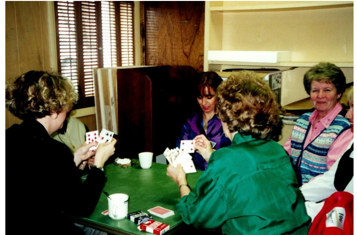
Card party fundraiser guests.