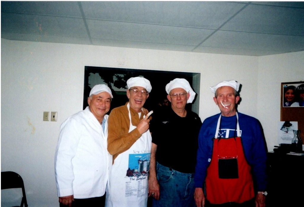
More photos from one of the Italian Dinner Fundraisers.