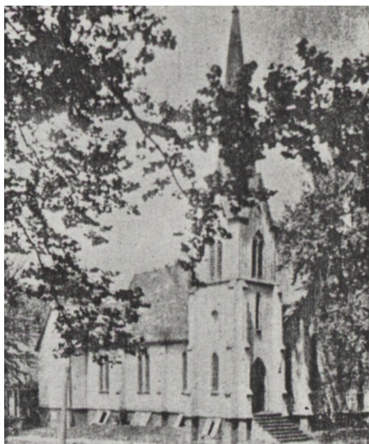
Photo of St. Paul's Episcopal Church from the early 1900s, before the excavation of the church's undercroft.

In 1850, about the same time that the county seat was moved from Tremont back to Pekin, the Episcopal parish in Tremont relocated to Pekin, and in June 1851 the parish was formally admitted to the convention of the Episcopal Diocese of Illinois. In those early days, Pekin's Episcopalians gathered for worship at various locations, but by 1861 their house of worship was a small schoolhouse on the south side of Elizabeth Street, at the site now occupied by the Marshall Building. Later the schoolhouse/church was moved to the southwest corner of Broadway and Buena Vista, and that served as St. Paul's Church until the consecration of the present St. Paul's.