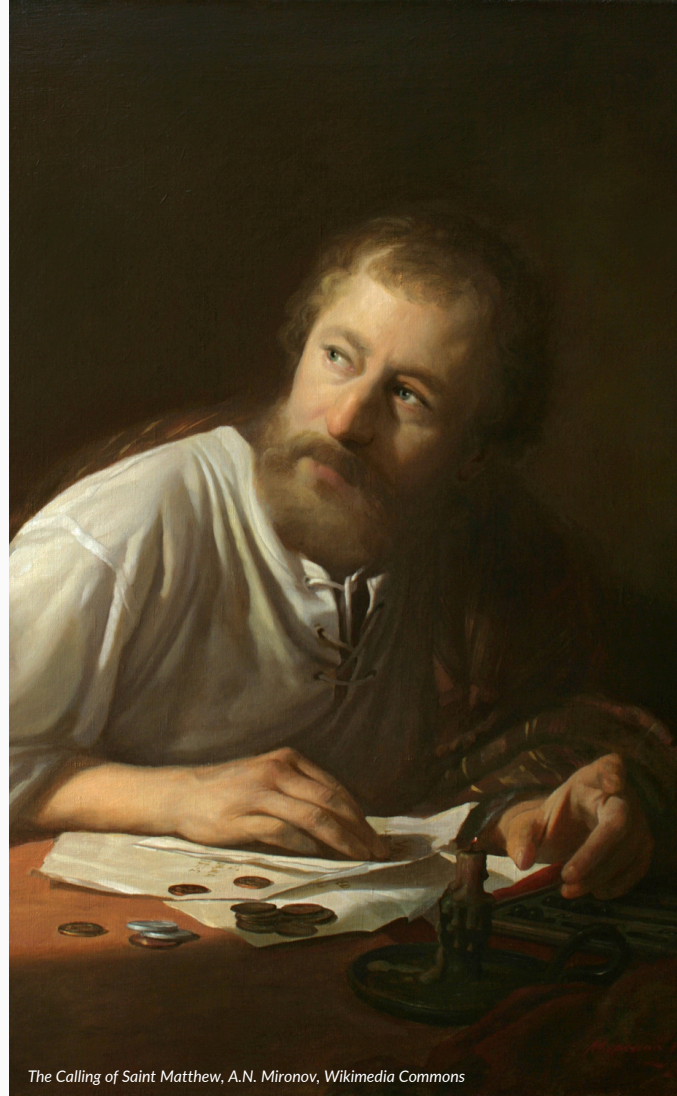
The Calling of Saint Matthew

You can visit our website to check out the most up-to-date prayer calendar ( click here ) or our diocesan calendar ( click here ) with feasts and other events listed for around the Diocese.