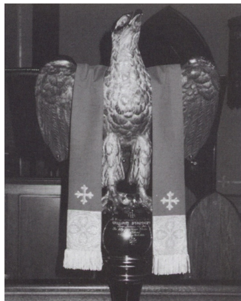
One of St. Paul's Episcopal Church's older pieces of liturgical furnishings, the eagle lectern.

Preparations for the construction of a new church at the opposite end of Buena Vista began in 1870 with the purchase of the lot for