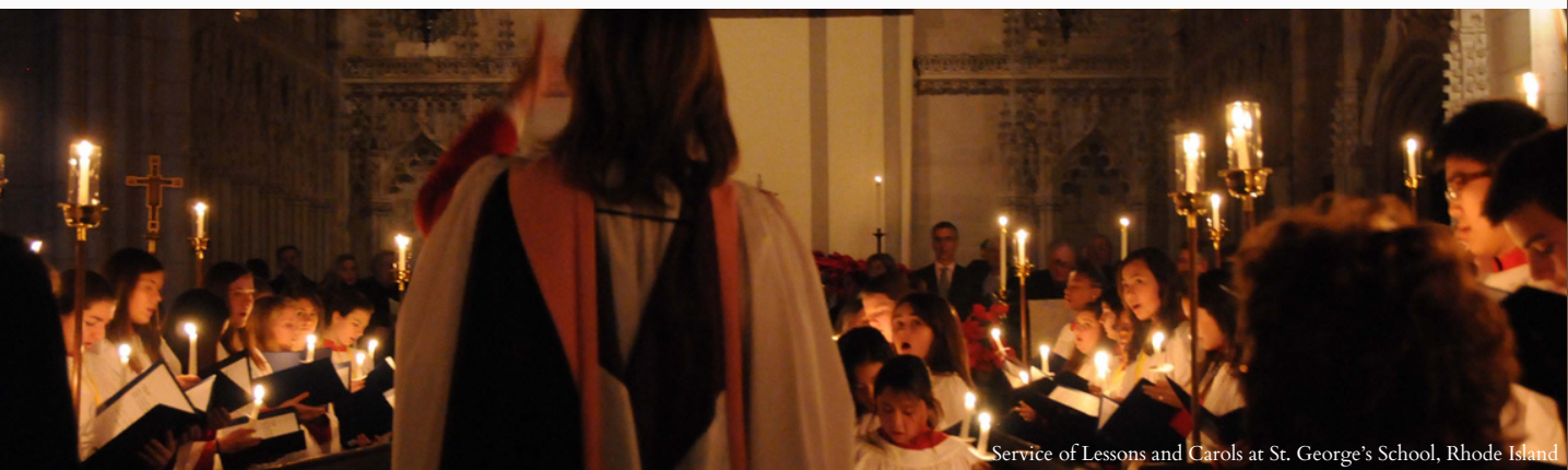
Service of Lessons and Carols at St. George's School, Rhode Island

All Saints', Morton invites you to a celebration of Lessons & Carols on Sunday, December 3rd. The festival will take us through the expectation of Advent and into the joy of Christmas, giving a microcosm of the seasons to help set the tone for December. The service will be preceded by a High Tea at 3:00pm in the church undercroft. The festival service will begin at 4:00pm.