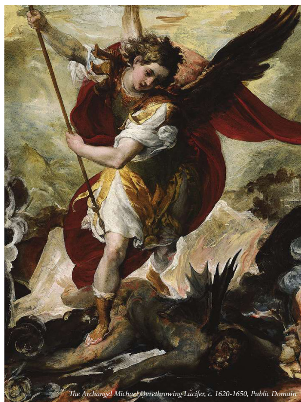
The Archangel Michael Overthrowing Lucifer, c. 1620-1650