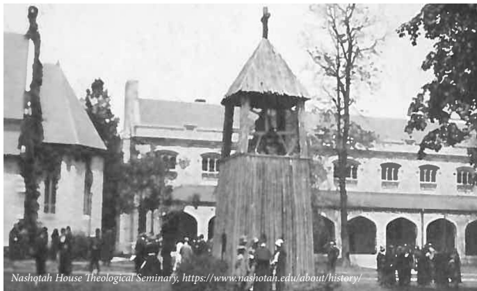
Nashotah House Theological Seminary

I am uncertain as to when or why our bell at Nashotah House was dedicated to St. Michael, but I suspect it has something to do with this tradition. Every year, we bless our big bell that sits in the middle of campus on his feast day. We do this because it's dedicated to the great archangel and reminds us of his intercessions and protections over Nashotah House. We have a Solemn Mass where we process out of our chapel, gather around Michael the bell, offer prayers, incense, holy water, and a blessing from the celebrant. At the conclusion of our liturgy, the entire community (spouses, children, friends, and the surrounding community) is invited to ring Michael, reminding them of their participation in the prayer life of our seminary.