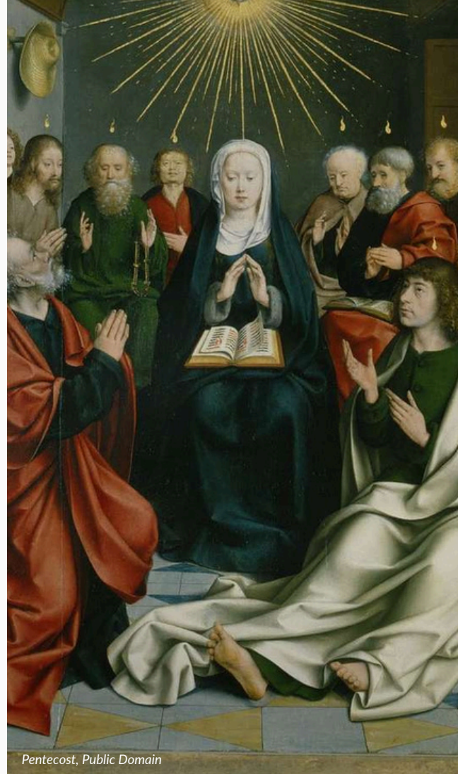
Pentecost, Public Domain

You can visit our website to check out the most up-to-date prayer calendar ( click here ) or our diocesan calendar ( click here ) with feasts and other events listed for around the Diocese.