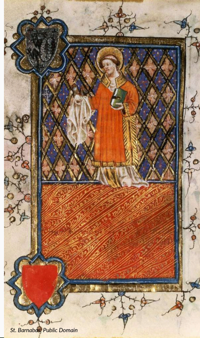
St. Barnabas, Public Domain

You can visit our website to check out the most up-to-date prayer calendar ( click here ) or our diocesan calendar ( click here ) with feasts and other events listed for around the Diocese.