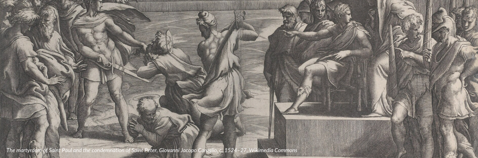
The martyrdom of Saint Paul and the condemnation of Saint Peter, Giovanni Jacopo Caraglio, c. 1524-27