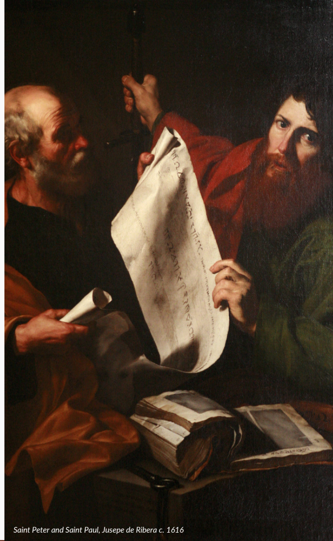
Saint Peter and Saint Paul, Jusepe de Ribera c. 1616

You can visit our website to check out the most up-to-date prayer calendar ( click here ) or our diocesan calendar ( click here ) with feasts and other events listed for around the Diocese.