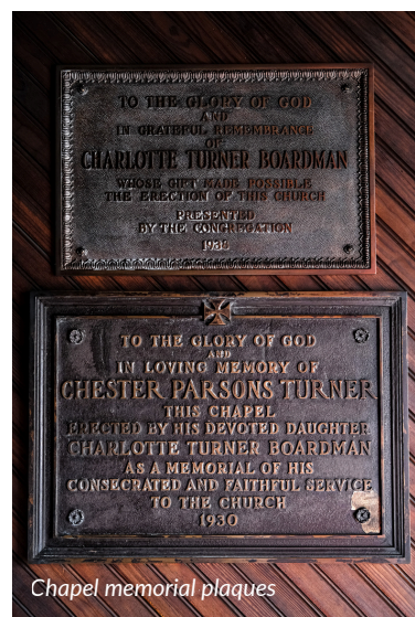
Chapel memorial plaques