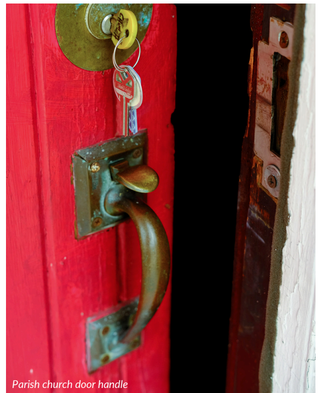
Parish church door handle