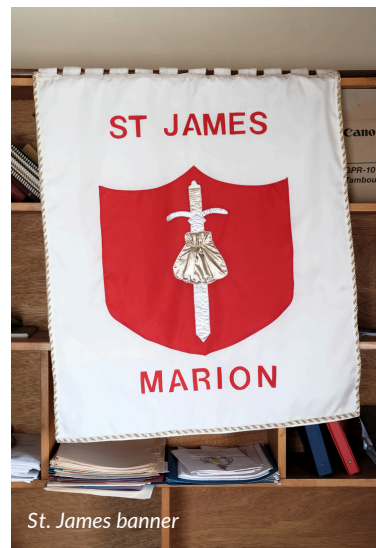
St. James banner