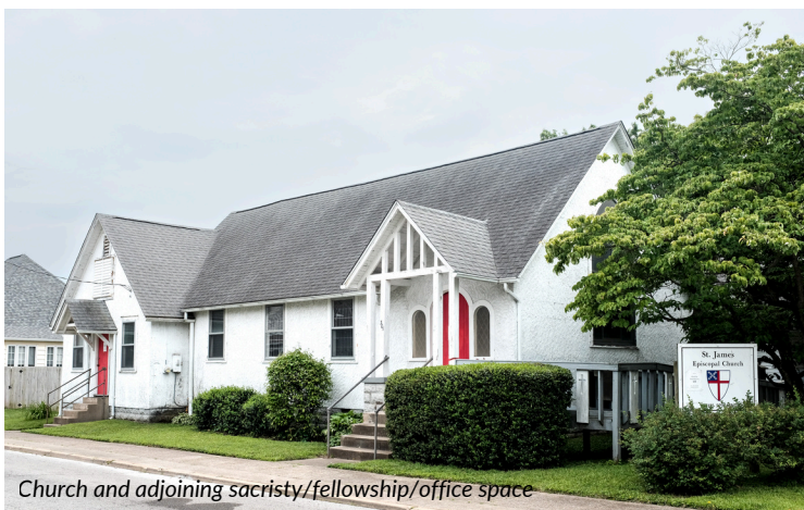
Church and adjoining sacristy/fellowship/office space