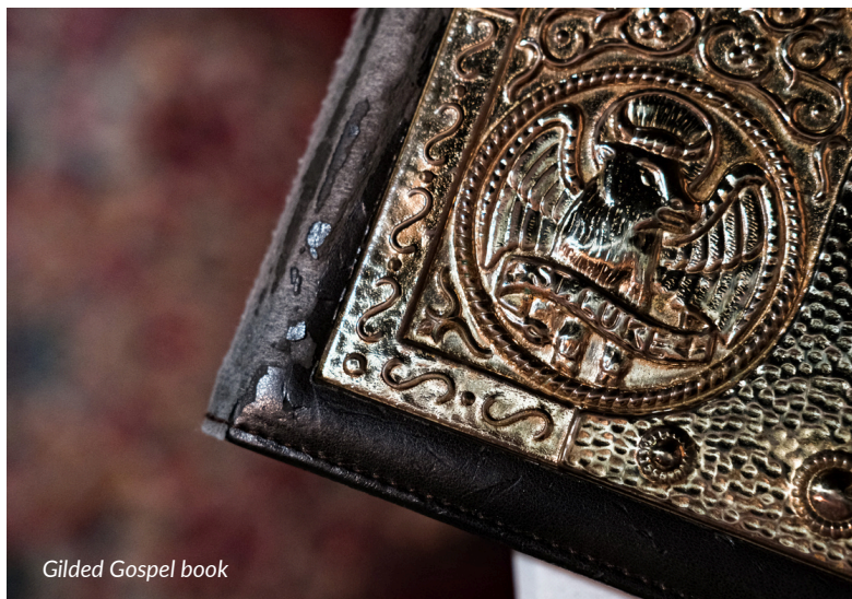
Gilded Gospel book