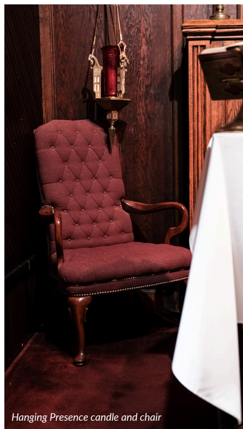
Hanging Presence candle and chair