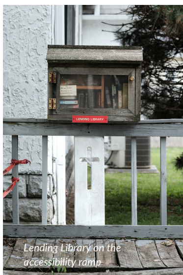
Lending Library on the accessibility ramp