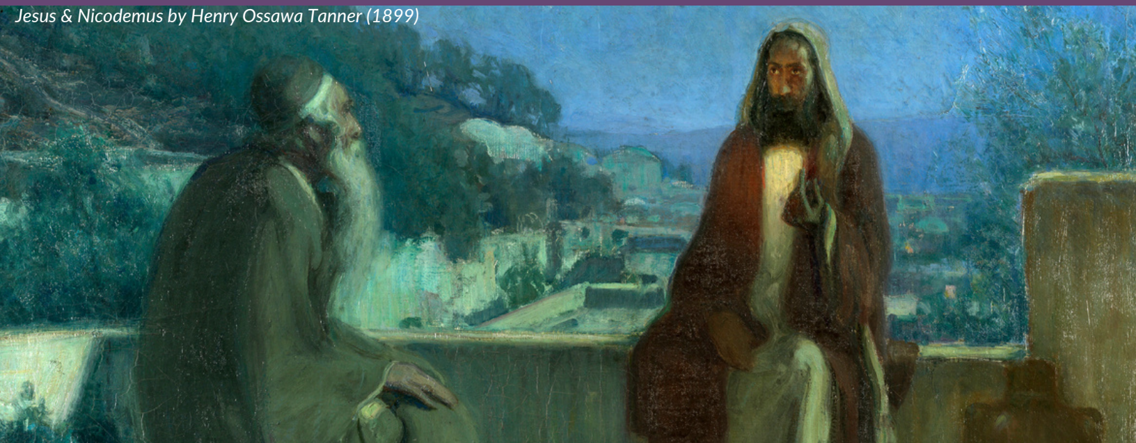
Jesus & Nicodemus by Henry Ossawa Tanner (1899)