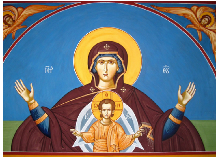
Our Lady of the Sign, classicalchristianity.com

Liturgically, however, our Sunday morning scripture readings focus on preparing not only for our commemoration of the Nativity but also looking toward the end times when the Lord will return to judge the world. We live every day in that tenuous moment between the incarnation and the final judgment, a tension that is highlighted during the season of Advent with a relentless call to stay awake and be prepared. We need to prepare ourselves spiritually, for we know neither the day nor the hour of Christ's return.