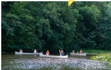
Canoe outing on the nearby Kaskaskia River