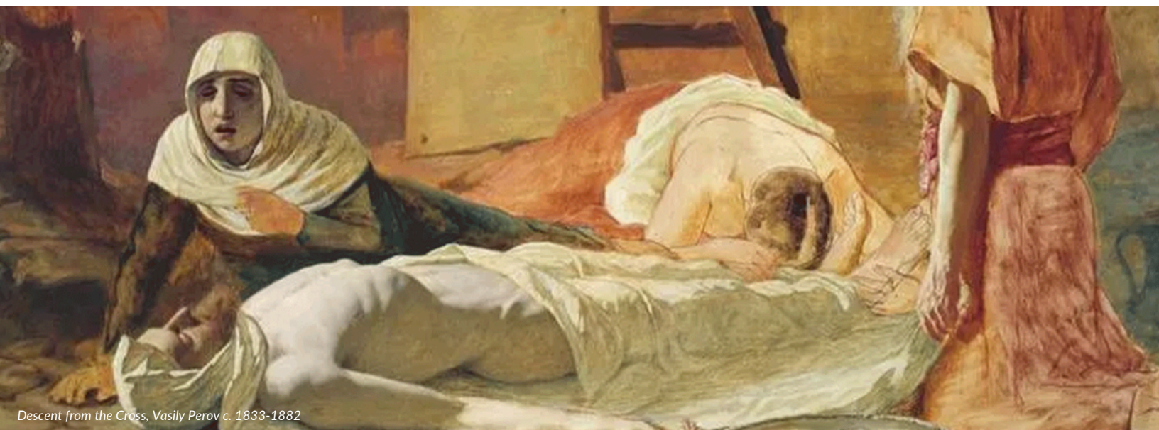
Descent from the Cross, Vasily Perov c. 1833-1882