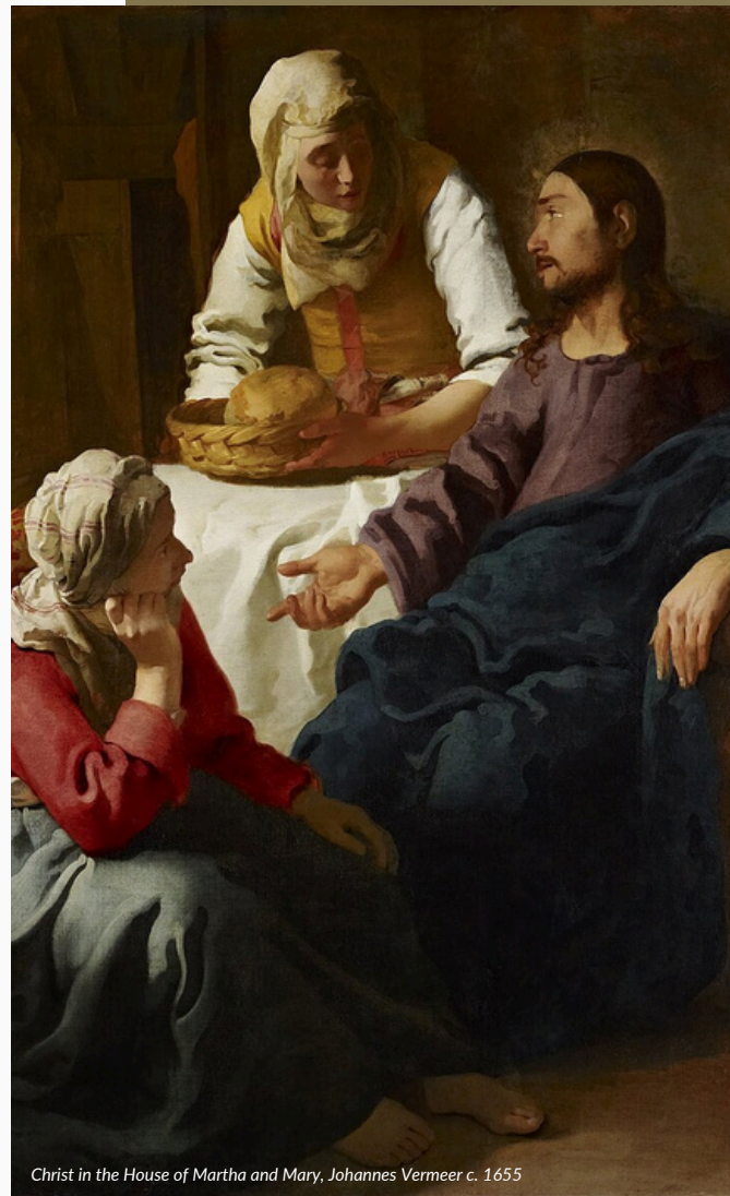
Christ in the House of Martha and Mary, Johannes Vermeer c. 1655

You can visit our website to check out the most up-to-date prayer calendar ( click here ) or our diocesan calendar ( click here ) with feasts and other events listed for around the Diocese.