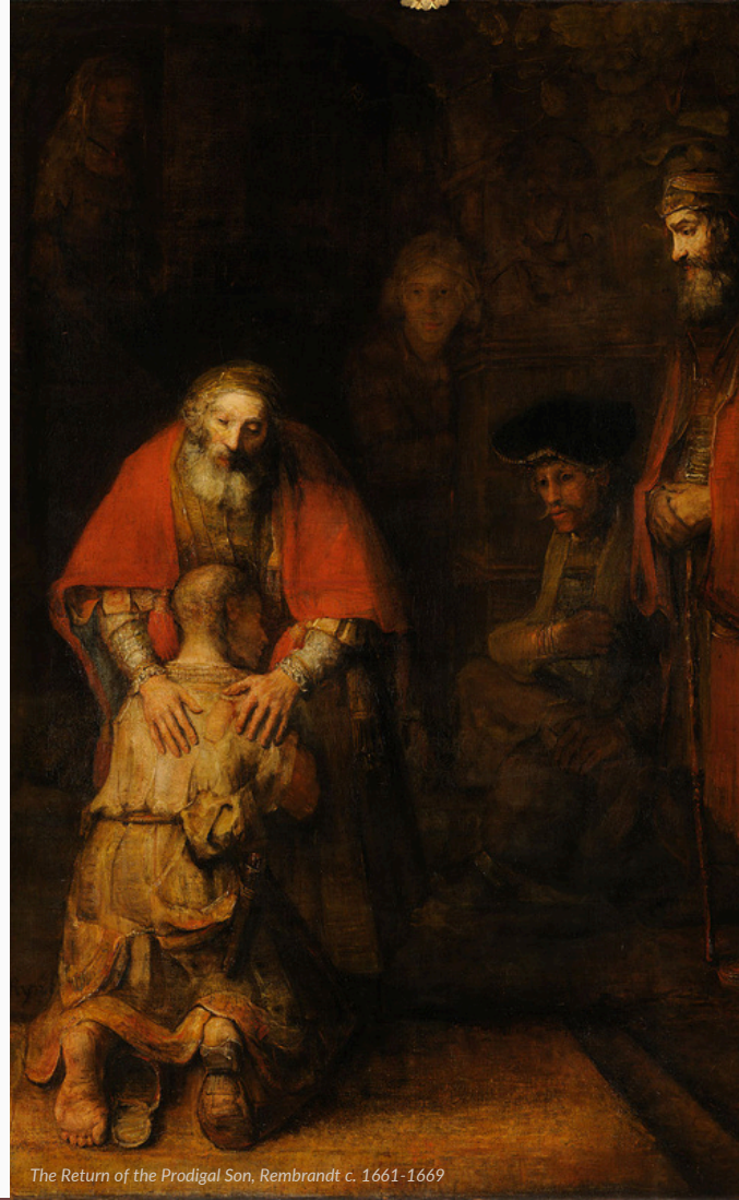
The Return of the Prodigal Son, Rembrandt c. 1661-1669

You can visit our website to check out the most up-to-date prayer calendar ( click here ) or our diocesan calendar ( click here ) with feasts and other events listed for around the Diocese.