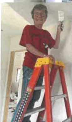
Hope's Habitat for Humanity Crew working in Cass Lake September 15, 2025