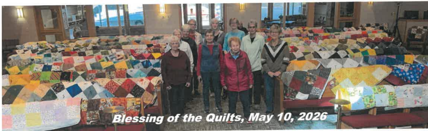
Blessing of the Quilts, May 10, 2026

The Walker Area Pregnancy Support Center's BABY BOTTLE FUNDRAISER runs through Father's Day, June 21. Pick up a baby bottle from the church narthex and use it to collect change and return it by Father's Day. The Pregnancy Support Center is a non-profit organization helping local parents facing unplanned pregnancies, with education and resources to help them make a positive start as a new family!