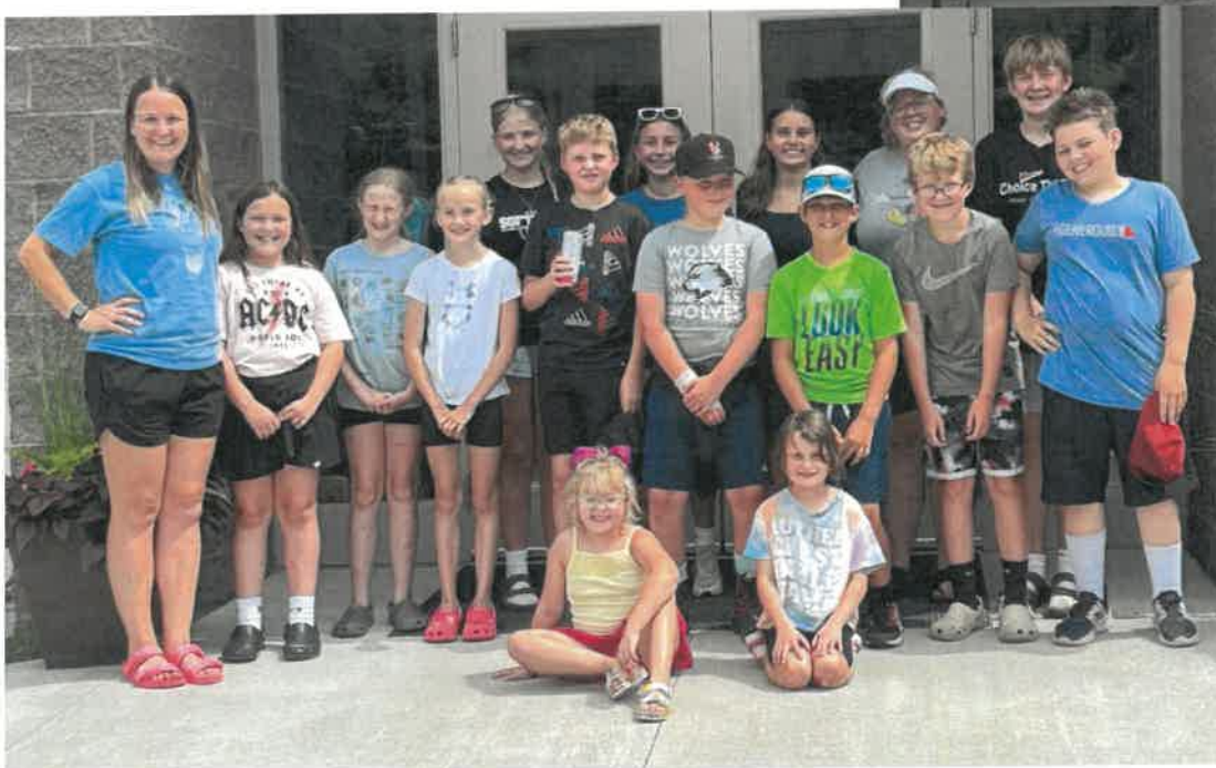
This group spent a week at Luther Crest Bible Camp near Alexandria during July, after raising money selling brats & dogs at Meat Boutique and serving as grocery baggers at Super One!

We also hosted an awesome Vacation Bible School Day Camp at Hope for over 50 kids during July!