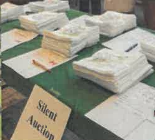
Christmas in July 2025