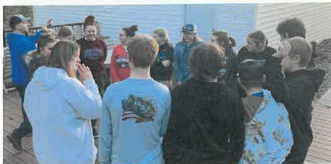
Photo from our March Created to Be FREE meeting

Wednesday May 8 th during 9 th -12 th Grade Release Time - Created to Be DISCIPLES