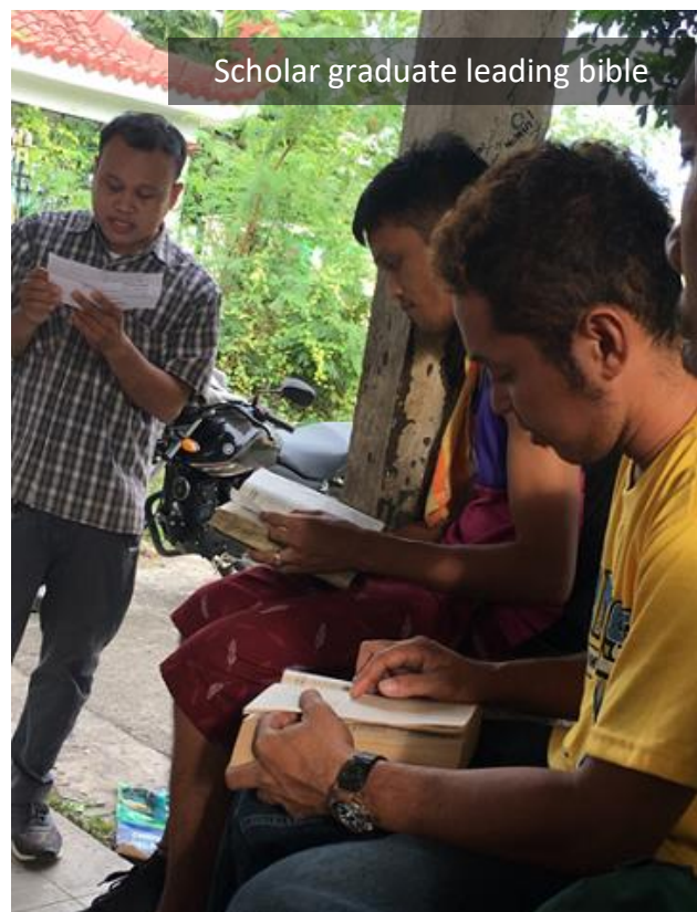
Scholar graduate leading bible

Please pray for safety for our boys as well as the salvation of the people in this dangerous community.