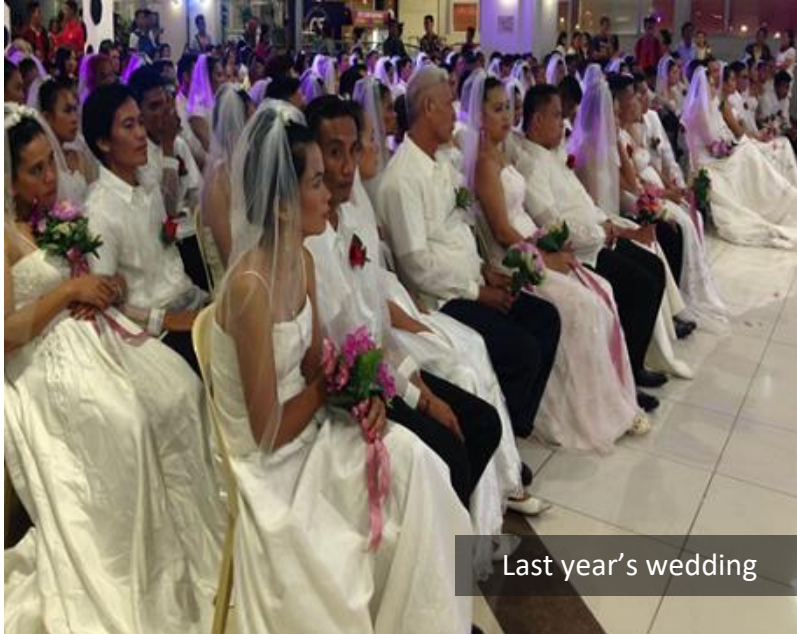
Last year's wedding