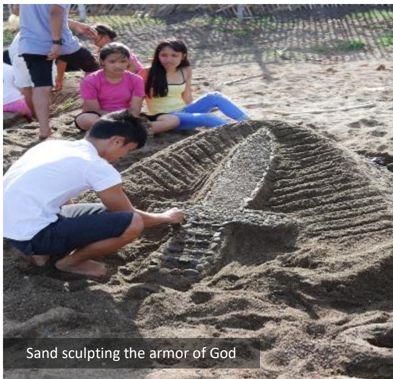
Sand sculpting the armor of God