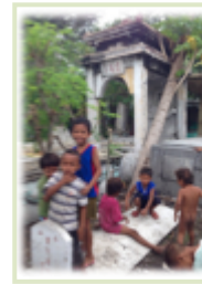
Sunday school group

The children are always excited to have the Bible stories told to them and are always delighted in singing scripture songs.