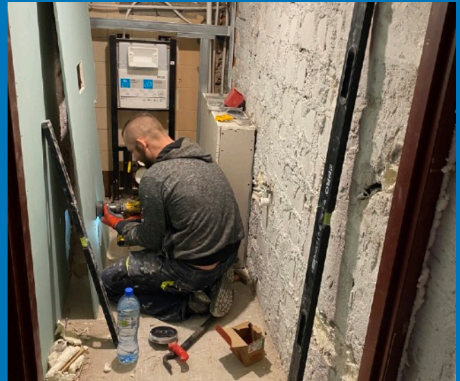
Finishing touches on a sight-dividing partition (L.), and behind-the-scenes improvements (R.) makes the worship center more functional.