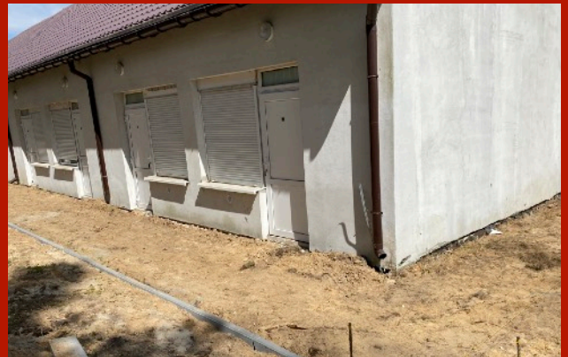
Inside, children help prepare the new worship center chairs, while outside, landscape work continues on the building.

Thank you to all who gave for the chairs and for the lawn tractor. The money has been raised! Praise the Lord.