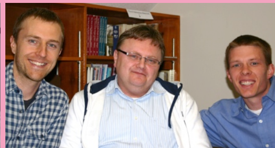
Memories from his visit in 2012: (L) helping with the harvest in rural Minnesota, (C) meeting with athletic coaches in urban Minneapolis, (R) sharing with a couple of the staff members at Elim Mission Church, Cokato, MN.