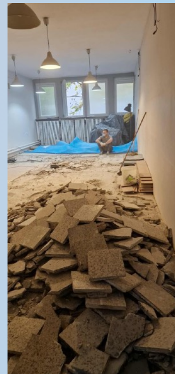
Youth Room before renovation