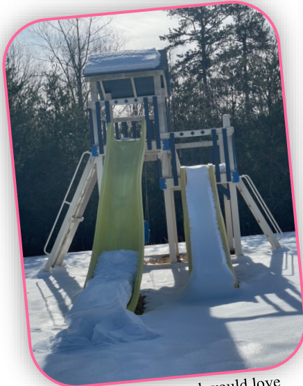
Even the playground would love to have warmer weather and children to be back playing!