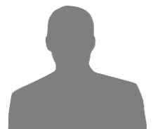
2025 - ???