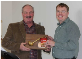
2017 - Bill Murray