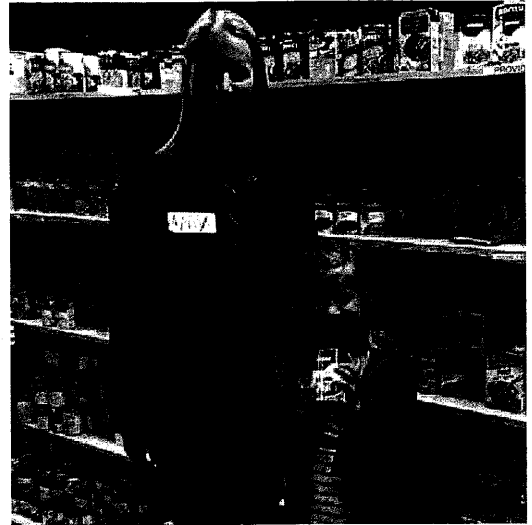
The food pantry is never as alive as when dozens of young hands (with a little help from a few not-so-young hands) date check donations and stock shelves for the coming week's shoppers. Fourth Graders from Girl Scout Troop 71751 are pictured above, with other photos taken of Christ the Redeemer parishioners who chose to help at the pantry as their outreach project on CTR's St. Nicholas Day of Service.