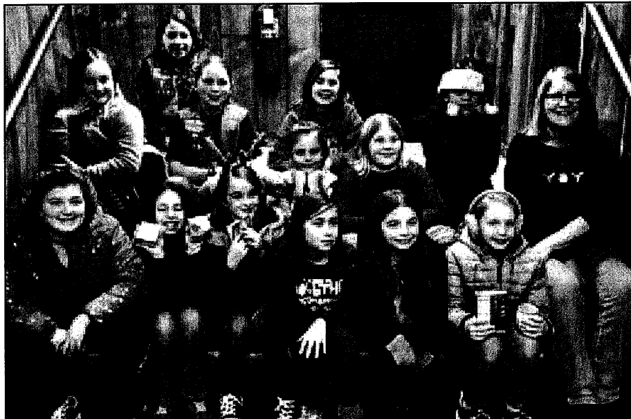
Pictured here and on page 2, Fourth Graders from Girl Scout Troop 71761 brought a large food donation to the pantry, along with dozens of young hands eager to help put some of the items on the shelves. Help also came from the young hands of Second Graders from Carpenter Elementary Wolf Den out of Cub Scout Pack 512.