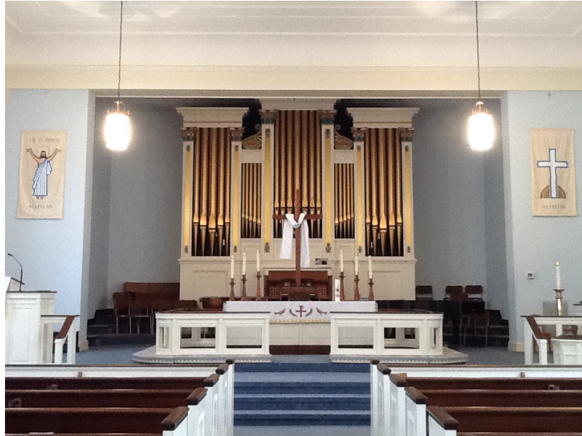
The Sanctuary seats up to 500 people.