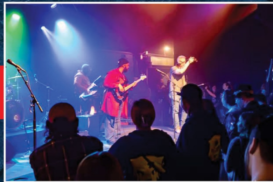
D'AYCH & The Next Level Band