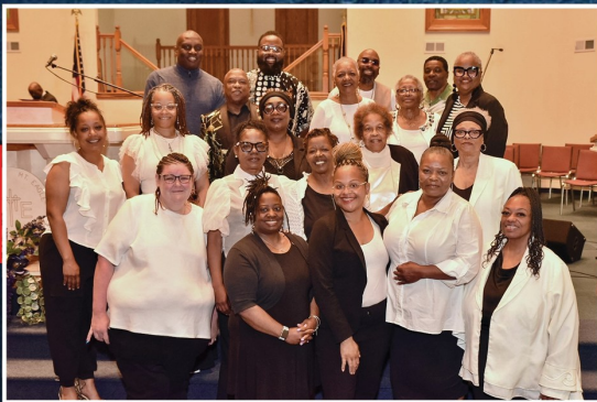
Greater Mount Eagle Praise Ensemble

Pre-Concert Event Included with Admission: 5:45-6:30PM "Harmonious Reunion" with Gospel Fusion Guest Artists