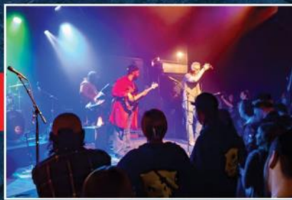
D'AYCH & The Next Level Band