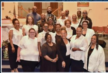
Greater Mount Eagle Praise Ensemble

5:45-6:30PM "Harmonious Reunion" with Gospel Fusion Guest Artists