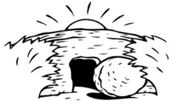
"He has risen! He is not here." Mark 16:6