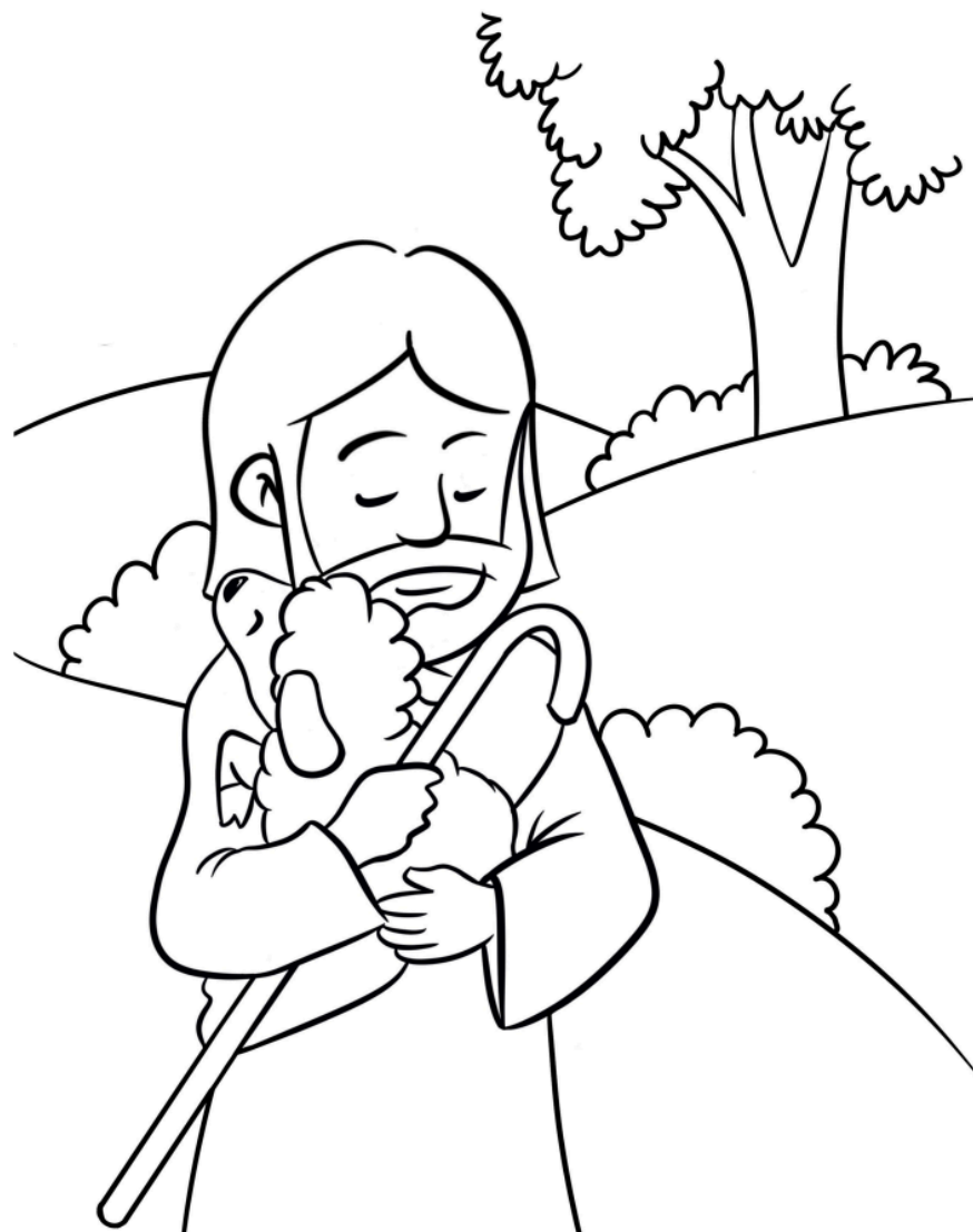
The Parable of the Lost Sheep