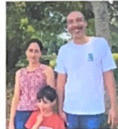
A saved Dad will make all the difference!