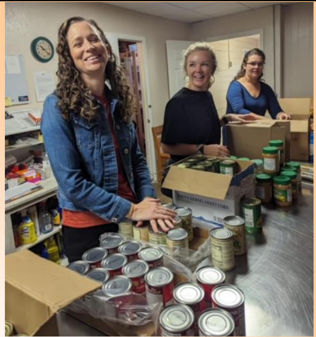
Children's Ministry helping at the Henry Center.