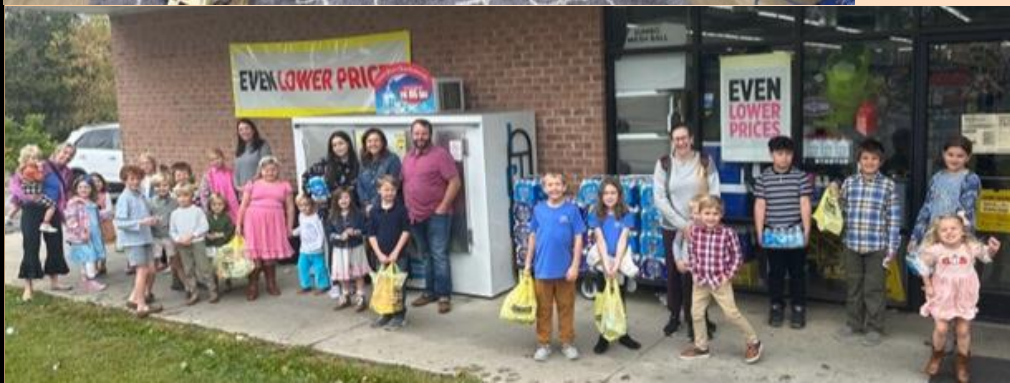
Children's Ministry taking a field trip to get items for the alley food box.