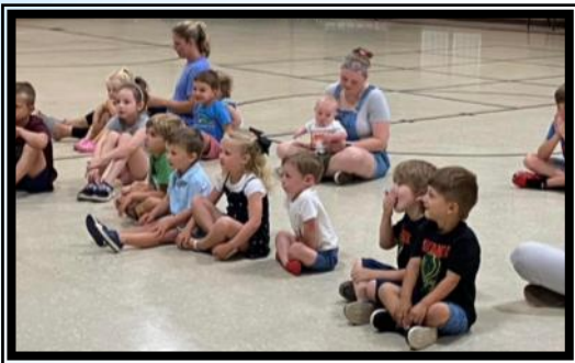
Children’s Story Time

Join us for BBQ and Bingo on Wednesday, July 19 from 5:30 – 6:30 in Davidson Hall. Our Church Council meeting will follow at 6:30 in the gym.