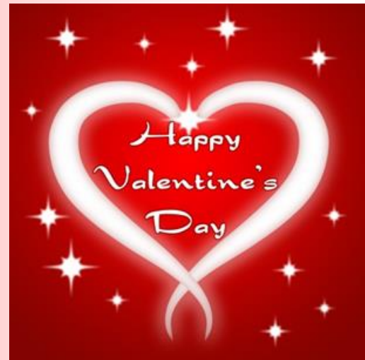
Wednesday, February 14, 2024 we will have a Valentine's Day Party. Put on your party hat and join us for the festivities. Food will be provided but you must sign up.