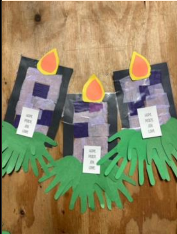
The children started off the Advent season with this craft