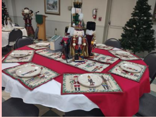
Dave Schmisser's Table