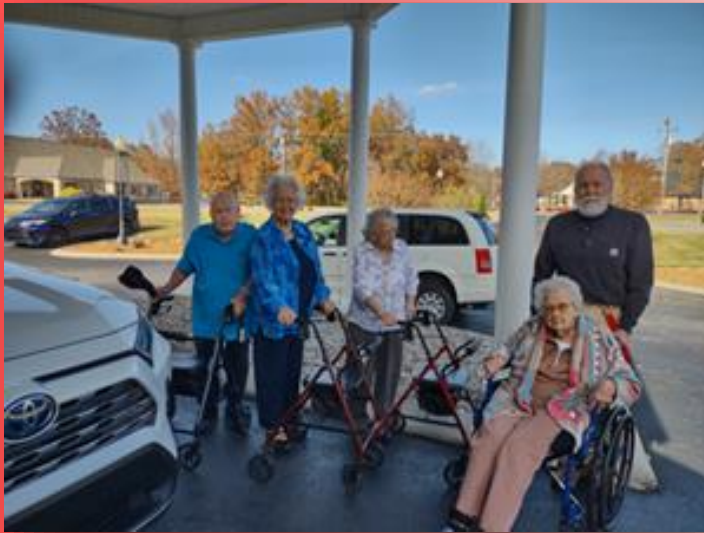
Residents of Brookdale are looking forward to coming to church using our Accessible van. We hope to have the program up and running, Sunday, January 14 th for the 11:00AM Service.