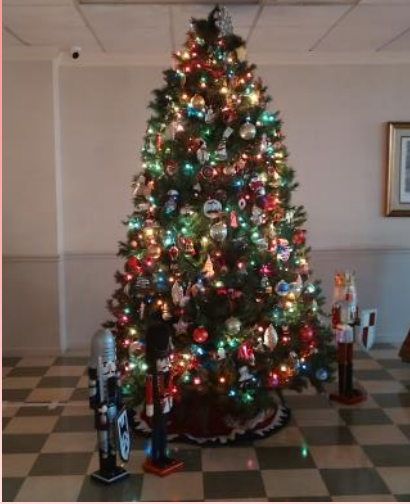
The Big Tree