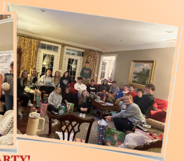
YOUTH CHRISTMAS PARTY!