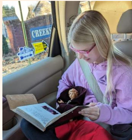
Baby Jesus traveled to many homes this season