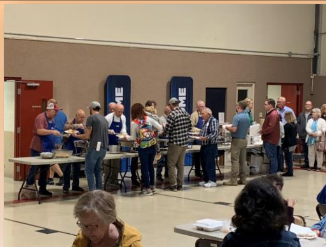
Check out some pictures from last month's Turkey Dinner!