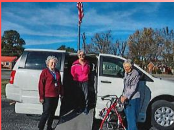
Residents of Brookdale looking over our Accessible van

As we approach the New Year, I would like to thank you for allowing me to serve the congregation and community of Tullahoma First Methodist Church. I am prayerful that God is at work in our Senior Adult Ministry. There is room for so many of you to get involved.