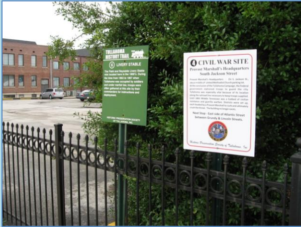
Tullahoma Historic Preservation Society Signs placed near the parking lot of FUMC.

The site also served as an important place during the Civil War. When Tullahoma was occupied by soldiers and under martial law in the 1860s, troops often gathered at this site for instructions and deployment information from their commanders.