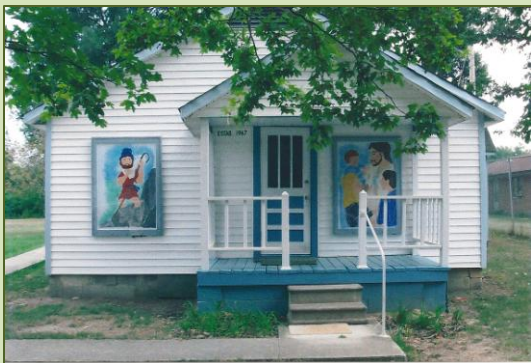
A modern day view of Dossett Chapel

Over the years the program has continued to have the Sunday School on Sunday mornings. Volunteers have also expanded the ministry by including Wednesday afternoon activities.