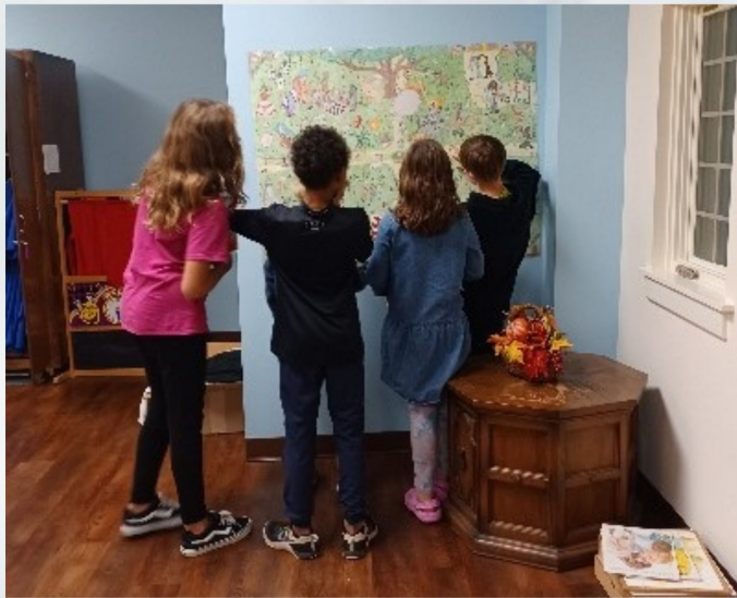
A few of the choir kids explore the new "Seek and Find" poster in the Children's space in Room 209