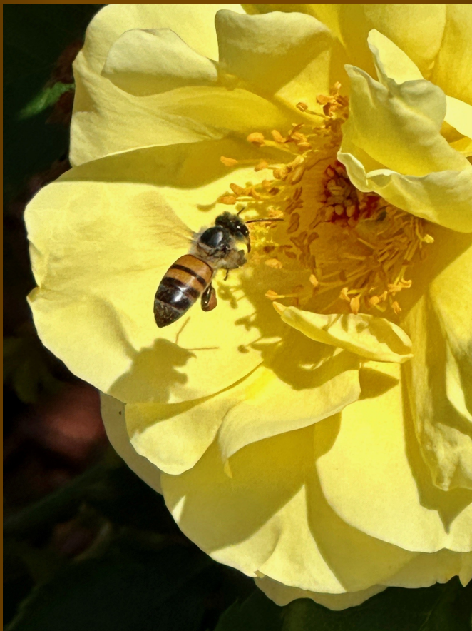
BEE IN FLOWER BY RITA WARREN

At Grace Bible Church we make, mature, and multiply disciples of Jesus.