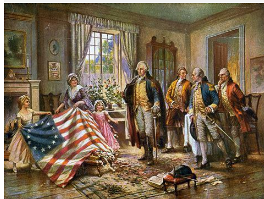
Betsy Ross Flag

On June 14, 1777, the Second Continental Congress officially adopted the American flag as our national symbol.