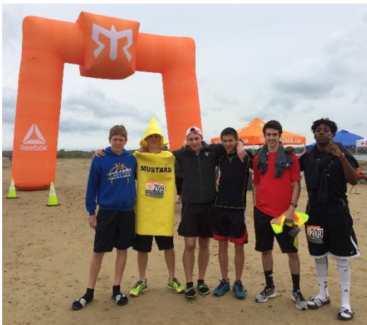
The 6 teenage guys on the team came ready to run!