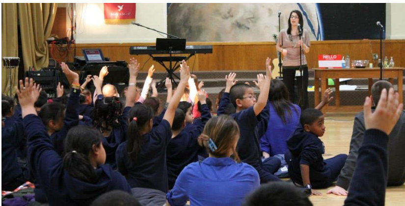
We always love the students' enthusiasm at MCA!