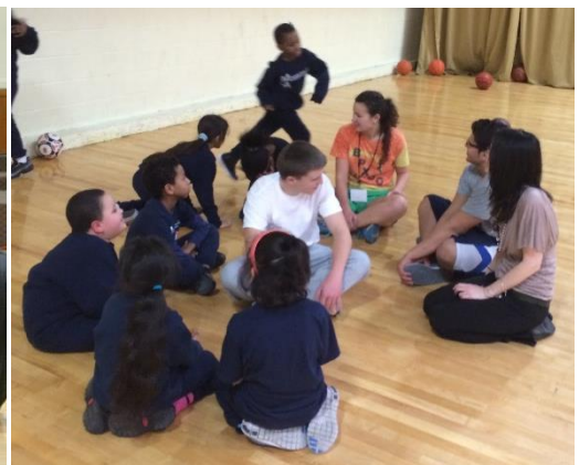
Duck, duck, goose!