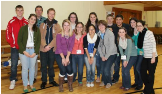
15 of our 18 team members