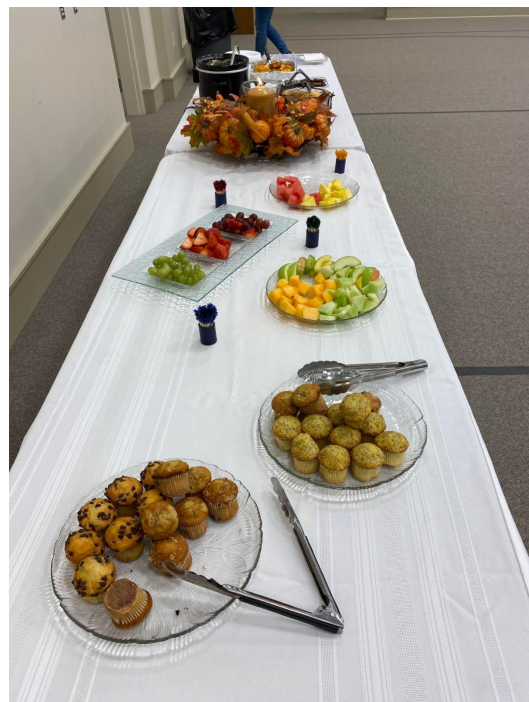
Youth Wednesday Activities - November 17, 2021