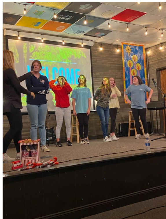
Father and Daughter Ball and Dinner - November 17. 2021