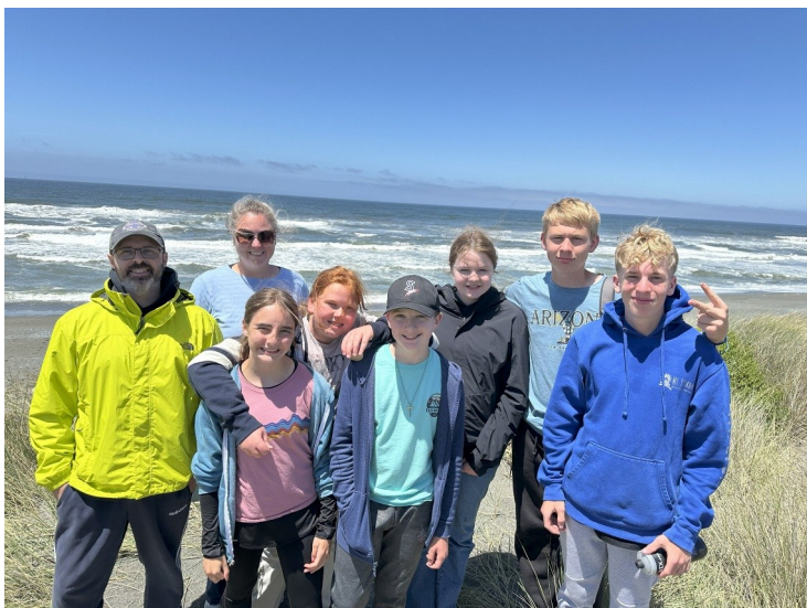
We removed invasive species along the beach as part of a restoration project.

We had 6 youth and 2 adults make the drive to Del Norte County, CA to connect with other United Methodist Churches. The youth made a lot of good friendships, worked hard, and had some fun too. The kids learned how to use power tools and worked on homes that needed repairs in the area. They worked on building ramps and rails, painting a house, and worked in a community garden. We are so thankful for our congregation's generosity and for always supporting our youth! Thank you so much!