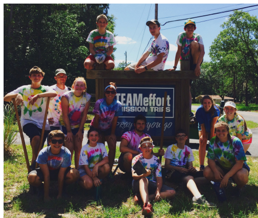
Youth on Mission Trip with TEAMeffort in Jacksonville, FL.