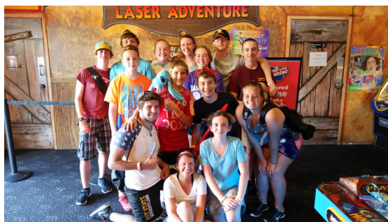
Youth during "free day" of Mission Trip.